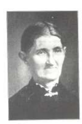
Міспанд, Халоніппа апіз Wife санк 139