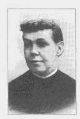
VALENTING ZARRHER AND WEEK